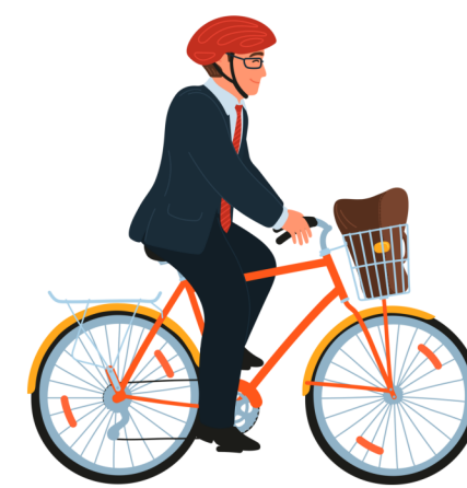
Cycle to Work Scheme