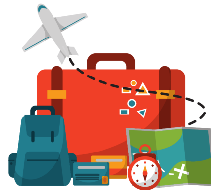
Support Staff get 5 additional annual leave days after 5 years continuous service