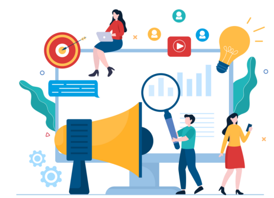
A fair and transparent People Strategy