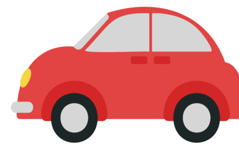
Access to Car Purchasing Discounts