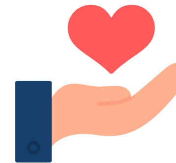
Access to an Employee Assistance Programme