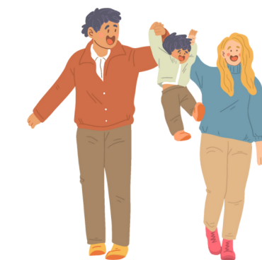
Generous Family Friendly Policy, Leave and Pay

Working together to provide the best outcomes for our schools and children.