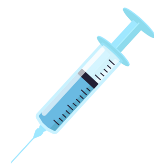
Free Flu Injection