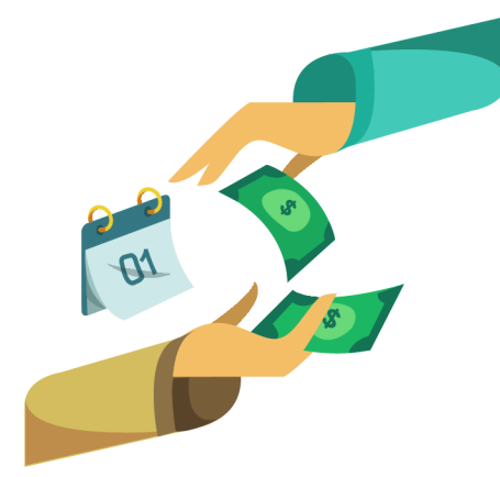
Emergency Salary Advance Scheme