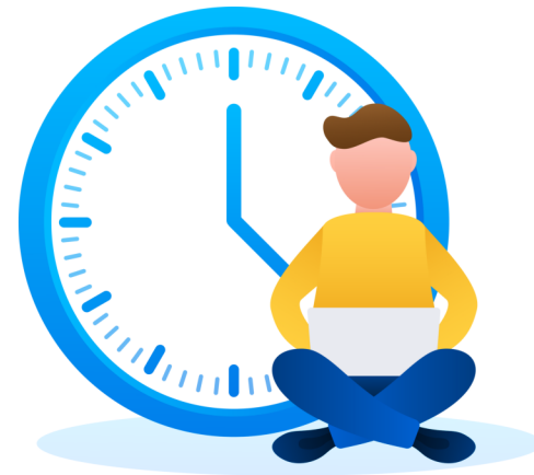
Strong commitment to flexible working