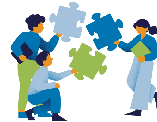
A culture of inclusion and belonging