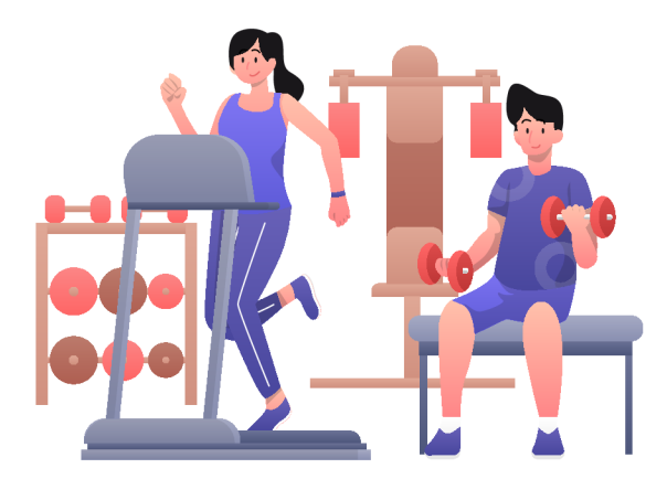
Gym Membership Discounts through Wiltshire Rewards and Blue Light Card