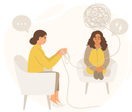
Access to free counselling