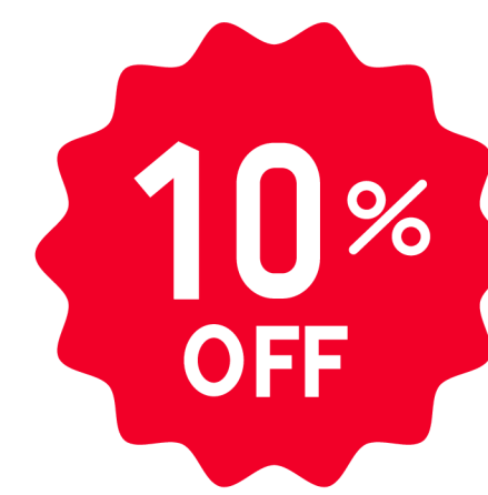
Retail Discounts through Wiltshire Rewards and Blue Light Card