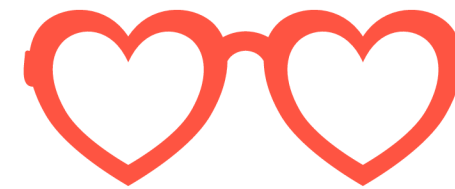
Free Eye Tests (VDU Users)