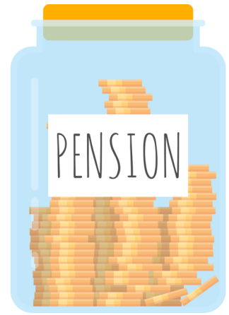
Generous contributory pension provision